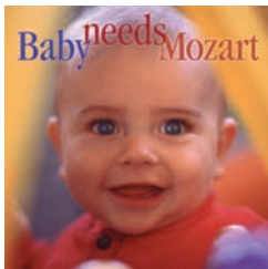
BABY NEEDS MOZART • DE/CS 1605