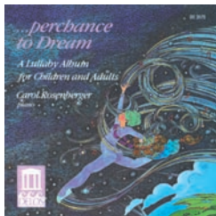
PERCHANCE TO DREAM • Lullaby Album for Children/Adults DE/CS 3079