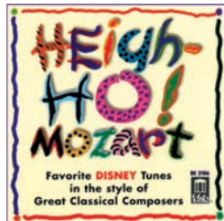
HEIGH-HO! MOZART • Favorite Disney Tunes in the Style of Great Classical Composers • DE/CS 3186

PARENT ALERT: To protect the ears of infants and very young children, the listening level for CDs should be lower than most adults accept as comfortable for themselves.