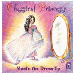
CLASSICAL PRINCESS • Music for Dress-Up • DE/CS 3215