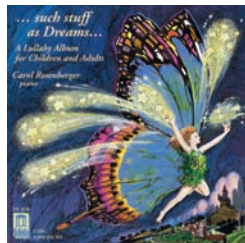
SUCH STUFF AS DREAMS • Lullaby Album for Children/Adults DE 3230