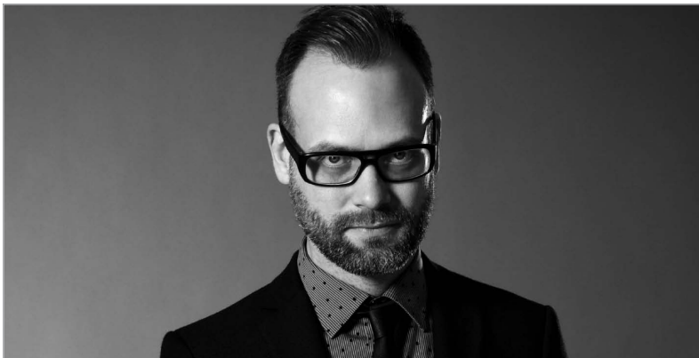
Joby Talbot